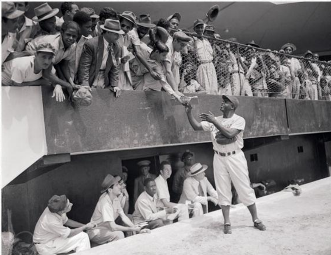
Jackie Robinson signs autographs on the first day of Spring Training, 1948

May 8, 2014 by media source | Leave Comment | No Comments