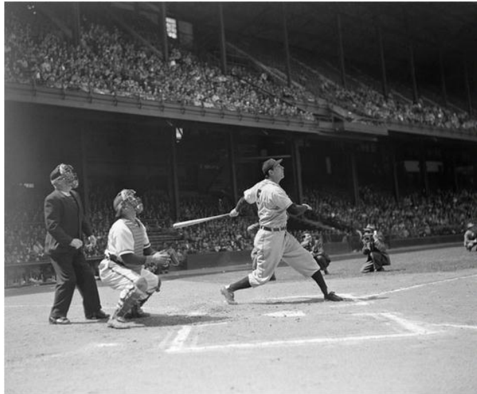
Hank Greenberg connects with the ball for a third inning homer against the Philadelphia Phillies, 1947