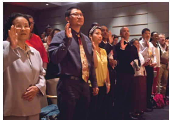
New American citizens were sworn in at the naturalization ceremony hosted by the Museum in May.