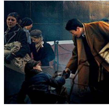
Still from Persona Non Grata .

In partnership with the Philadelphia Chapter of the Japanese American Citizens League and the Philadelphia Asian American Film Festival